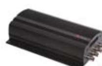
Rialto A4 Analytic Bridge